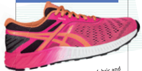
↑ Trainers with seamless upper fabric and gel cushioning, $85, asicsamerica.com