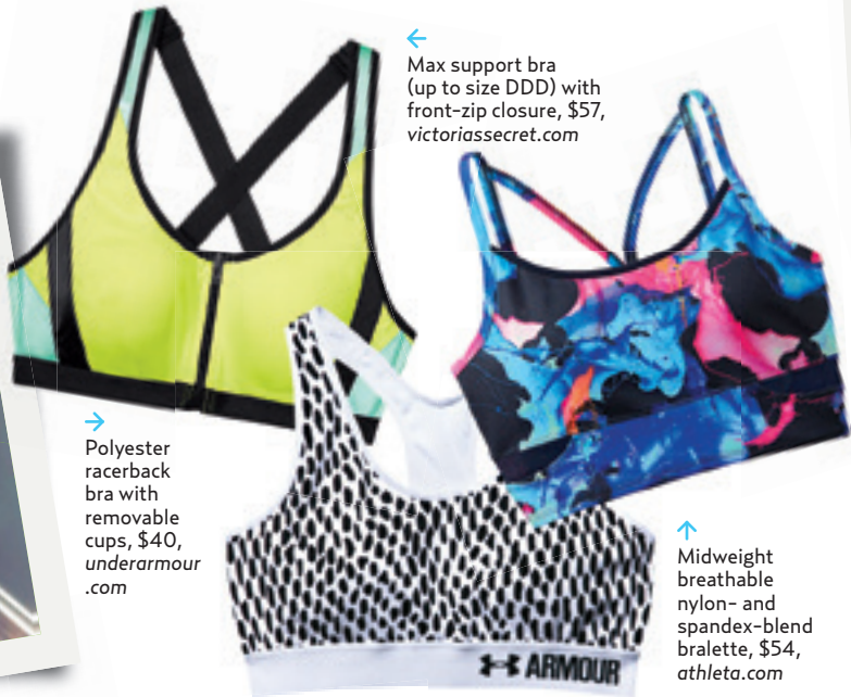
→ Polyester racerback bra with removable cups, $40, underarmour.com