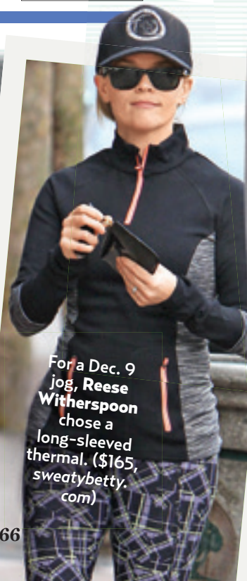
For a Dec. 9 jog, Reese Witherspoon chose a long-sleeved thermal. ($165, sweatybetty.com)