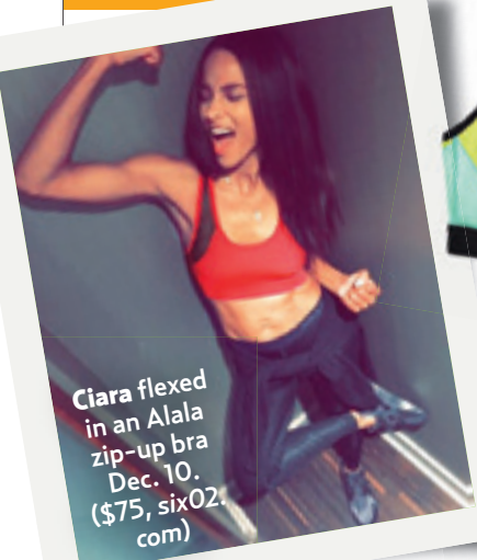
Ciara flexed in an Alala zip-up bra Dec. 10. ($75, six02.com)