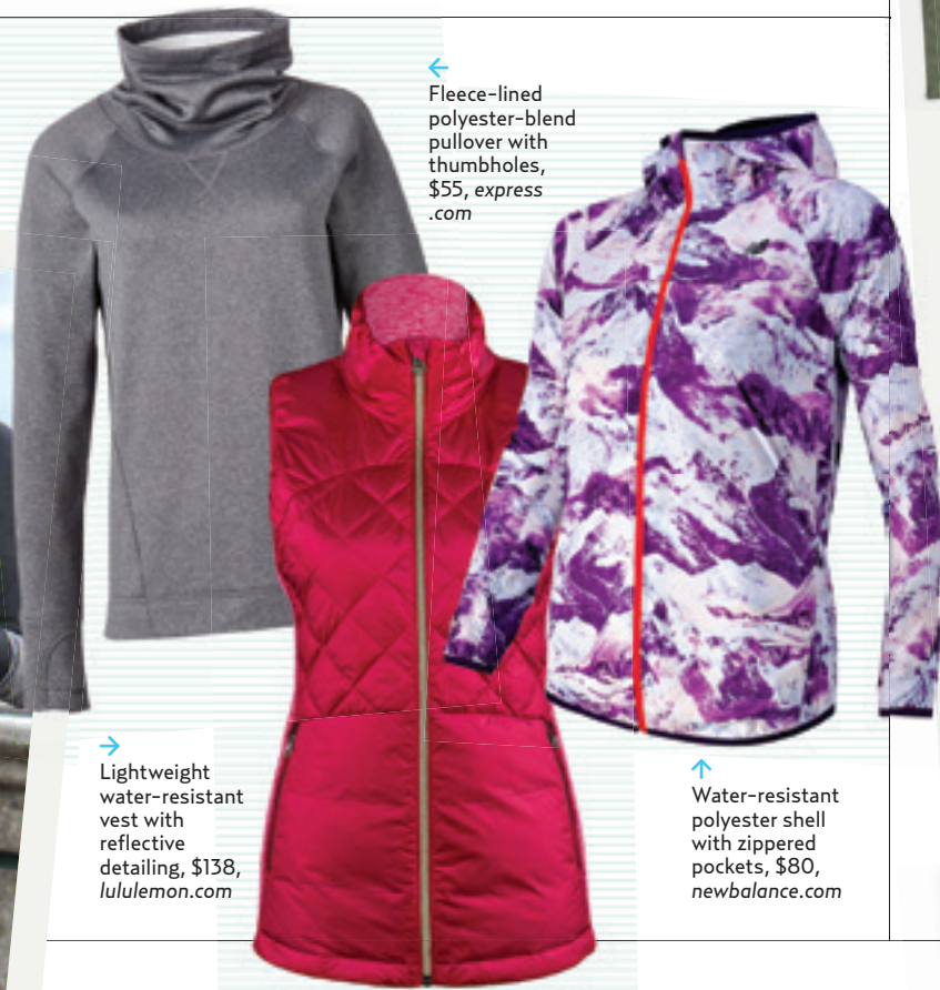
→ Lightweight water-resistant vest with reflective detailing, $138, lululemon.com