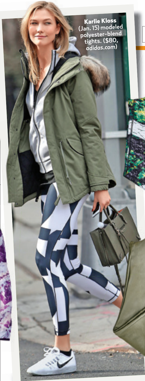
Karlie Kloss (Jan. 15) modeled polyester-blend tights. ($80, adidas.com)