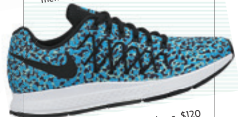
↑ Lightweight mesh running shoes, $120 (plus $15 for personalization), nike.com