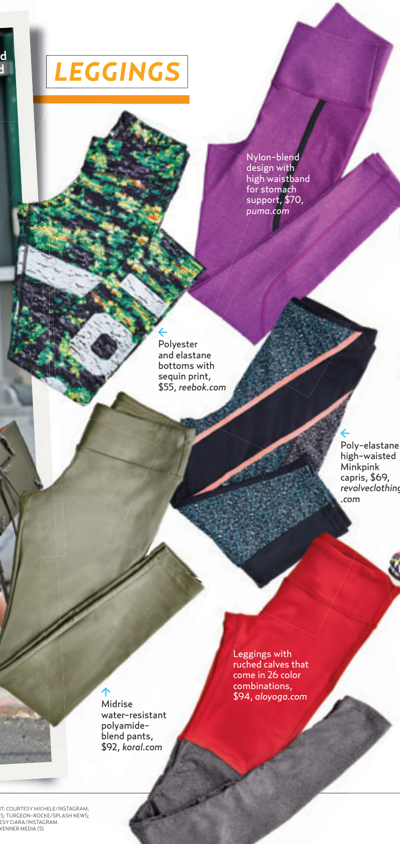
← Polyester and elastane bottoms with sequin print, $55, reebok.com